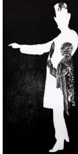
"LOOKING FOR CLUES" ETCHING, COLLIN COLE